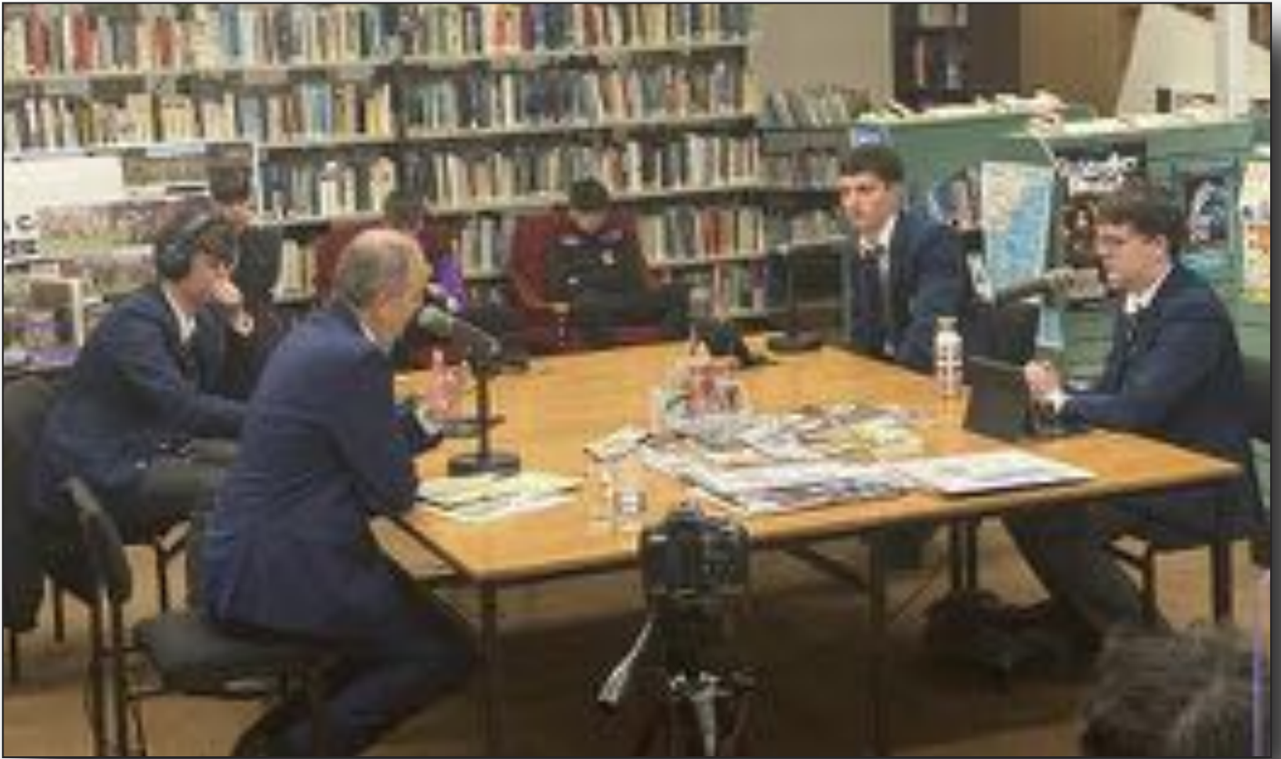
Tanáiste Micheál Martin TD is interviewed by PBC Podcast

This year's cohort of TY podcasters produced a dazzling series of episodes and further enhanced the reputation of the PBC Podcast as one of the most successful school podcasts in the country.