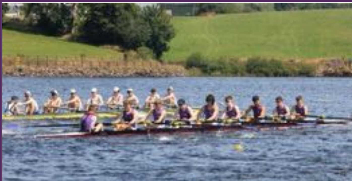
The historic Pres Junior 8 in action at the National Championships