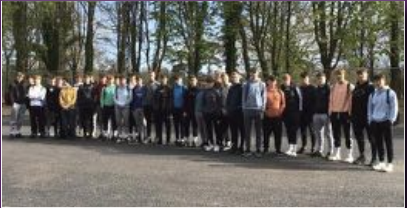
5th Year Biology group pictured in Killarney, 21st April 2023