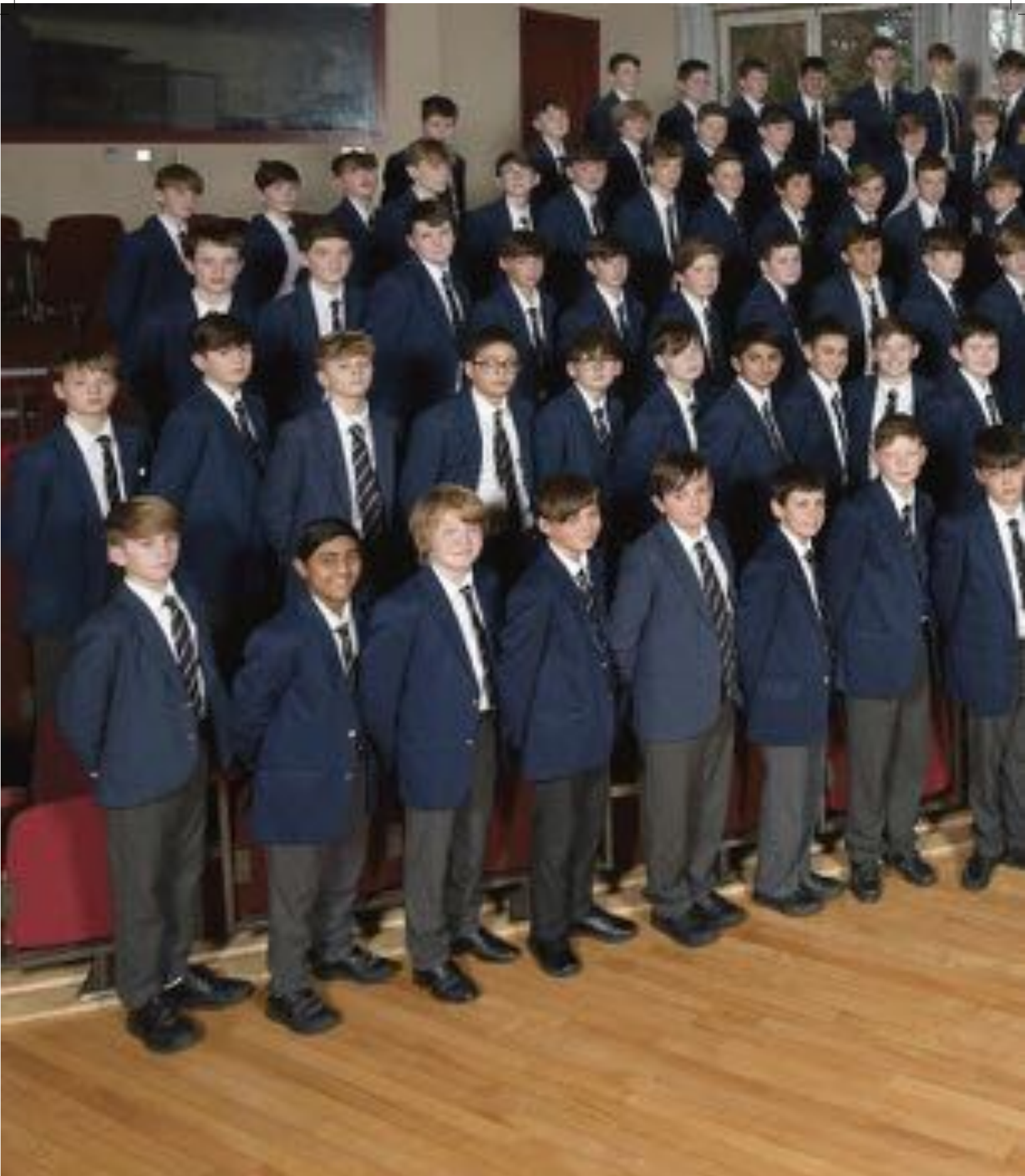
The Class of 2023 as 1st Years back in 2017