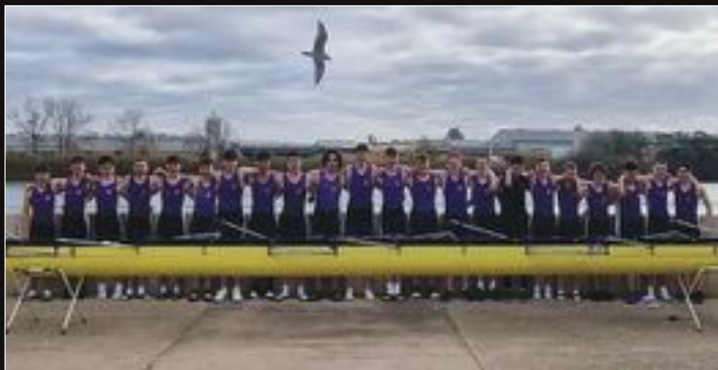
The combined Junior 16 and Junior 18 squad at the warm weather training camp in Spain

Over the Easter break, 22 rowers from the Junior 16 and 18 squads travelled to Amposta, Spain for a week-long training camp. The camp would provide the rowers with a change of scenery from the Marina, and hopefully some warm and sunny weather! Two sessions per day saw the squad clock up 200km of rowing by the end of the week in great conditions. When not on the water, the rowers enjoyed downtime in the quiet town of Amposta while recovering for the following days training. On the final day of camp, the group headed to an adventure park for a well-deserved break from the boats! A big thank you to Ms Cathy Hennessy, Ms Shannen Dawkins, Mr Eoin Hennessy and Mr Stephen Hayes who looked after the group for the week. We are also very grateful to Irish Rugby Tours for their help organising the trip.