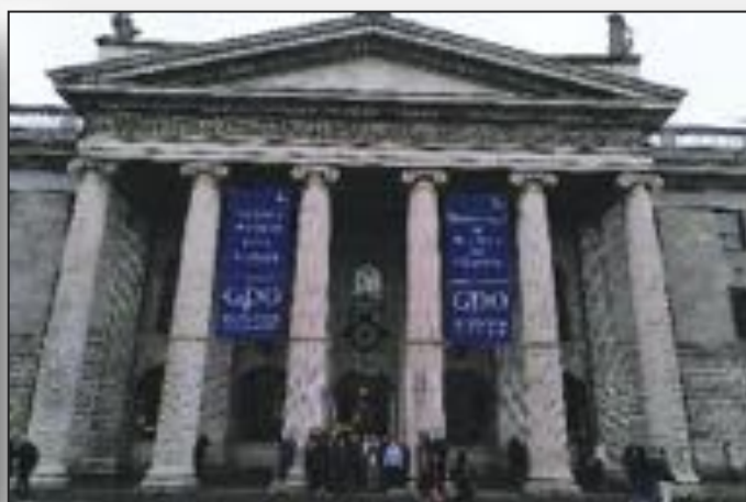
PBC students digest the 1916 visual presentation at the GPO