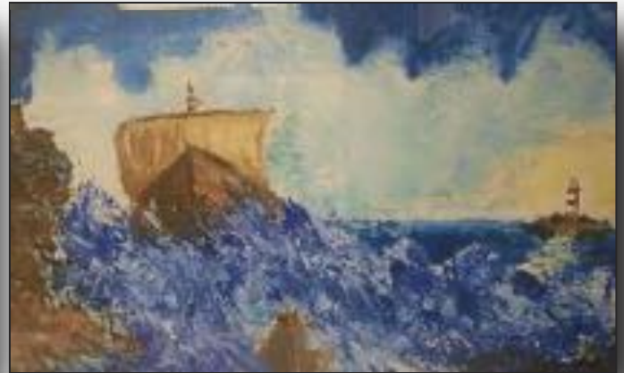
Eoin Derham, 2009