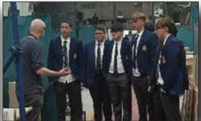
Visiting the National Sculpture Factory