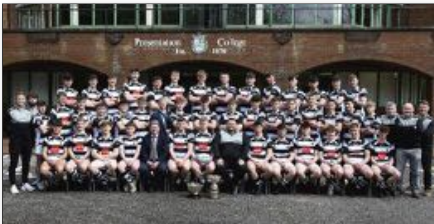
The victorious 2023 Senior Cup Squad

PBC Rugby is very much a team effort we are constantly looking for new people to help us out. Please come and join us in Wilton to help if you can, or just for a chat and a coffee. 'Ní neart go cur le chéile!' There is strength in numbers. We look forward to seeing you all in Wilton next season, for what hopefully will be another hugely successful year in PBC Rugby.