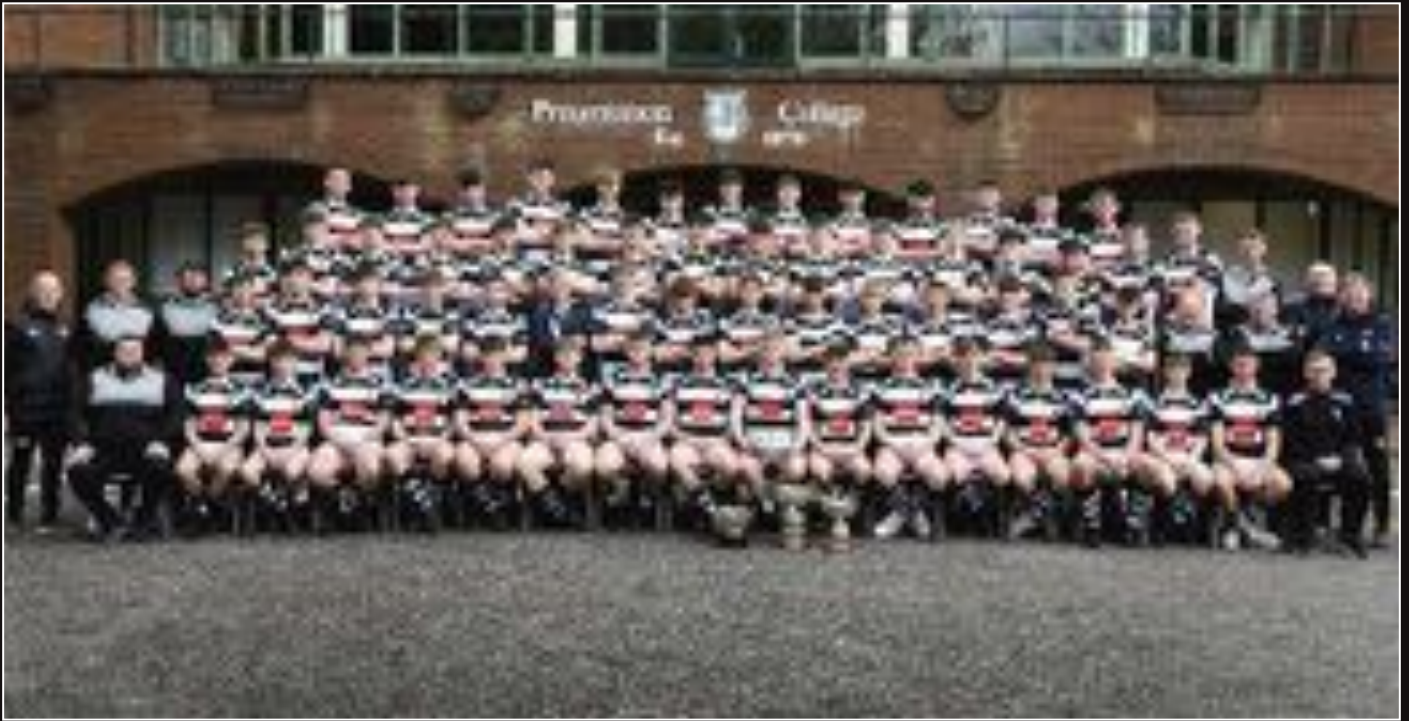
The victorious 2023 Senior and Junior Cup Squads

Another enthralling year in PBC Rugby, Senior Cup Champions, back-to-back Junior Cup Champions, back-to-back McCarthy Cup Champions. PBC have now contested the final of every competition at age grade in Munster Rugby in the last two years. Our Bowen Shield and Barry Cup teams were just pipped in their respective finals by CBC, with our Senior team taking revenge for a 1st Round defeat with an emphatic 24-0 win over our rivals on the hill in an outstanding final performance that will live long in the memory of all those in the Pres family.