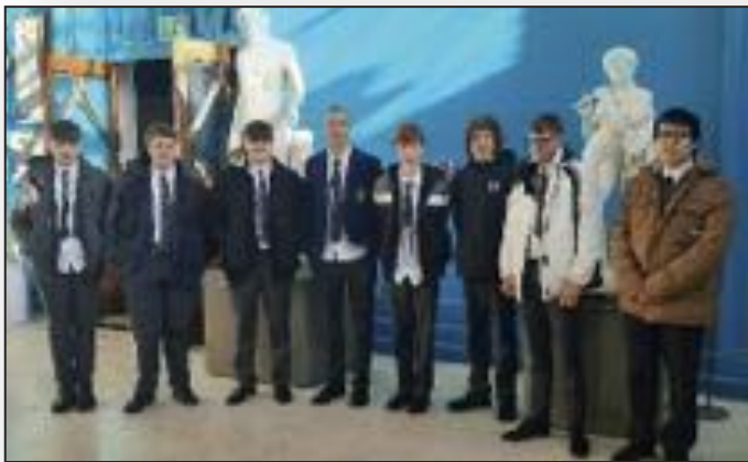
Visiting the Crawford Art Gallery