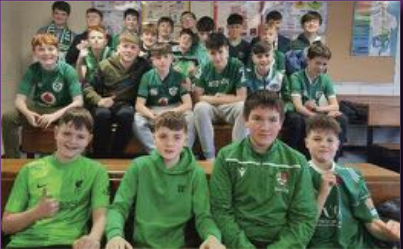
Students from Class 1C get into the spirit of Green Schools' Week