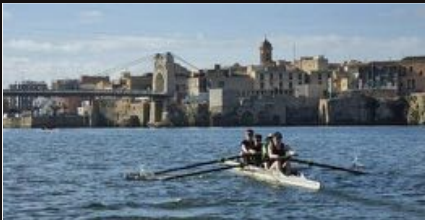
The Junior 16 Four heading to the Old Town

Over the Easter break, 22 rowers from the Junior 16 and 18 squads travelled to Amposta, Spain for a week-long training camp. The camp would provide the rowers with a change of scenery from the Marina, and hopefully some warm and sunny weather! Two sessions per day saw the squad clock up 200km of rowing by the end of the week in great conditions. When not on the water, the rowers enjoyed downtime in the quiet town of Amposta while recovering for the following days training. On the final day of camp, the group headed to an adventure park for a well-deserved break from the boats! A big thank you to Ms Cathy Hennessy, Ms Shannen Dawkins, Mr Eoin Hennessy and Mr Stephen Hayes who looked after the group for the week. We are also very grateful to Irish Rugby Tours for their help organising the trip.