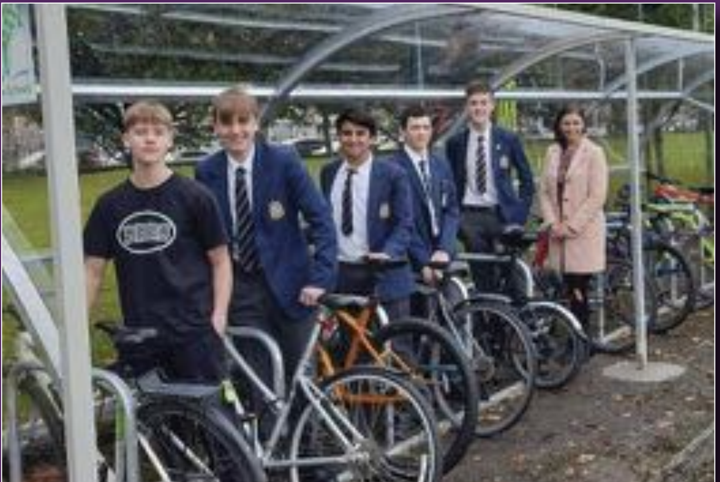
The Green Schools' Committee make use of one of the new school bicycle sheds