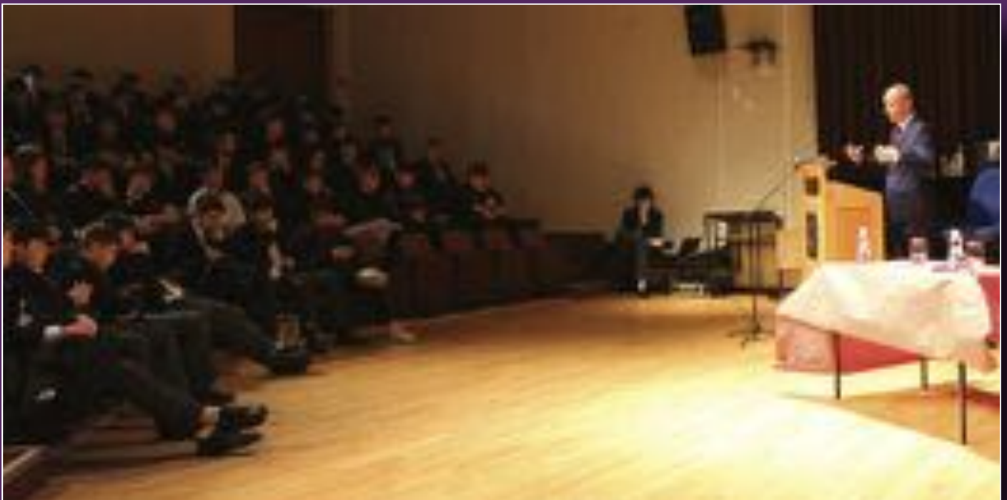
Tanáiste Micheál Martin TD addresses an audience of History and Politics students in the Dan Donovan Theatre