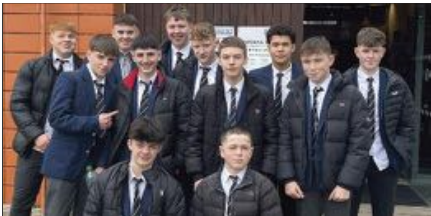
A large group of 3rd Year students pictured outside the Cork Public Museum in FitzGerald's Park