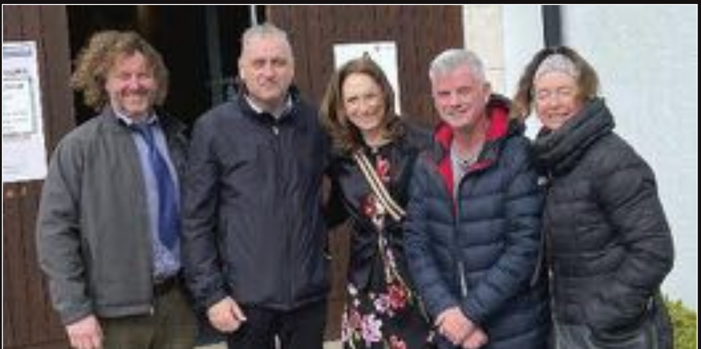
A breezy day in Fitzgerald's Park