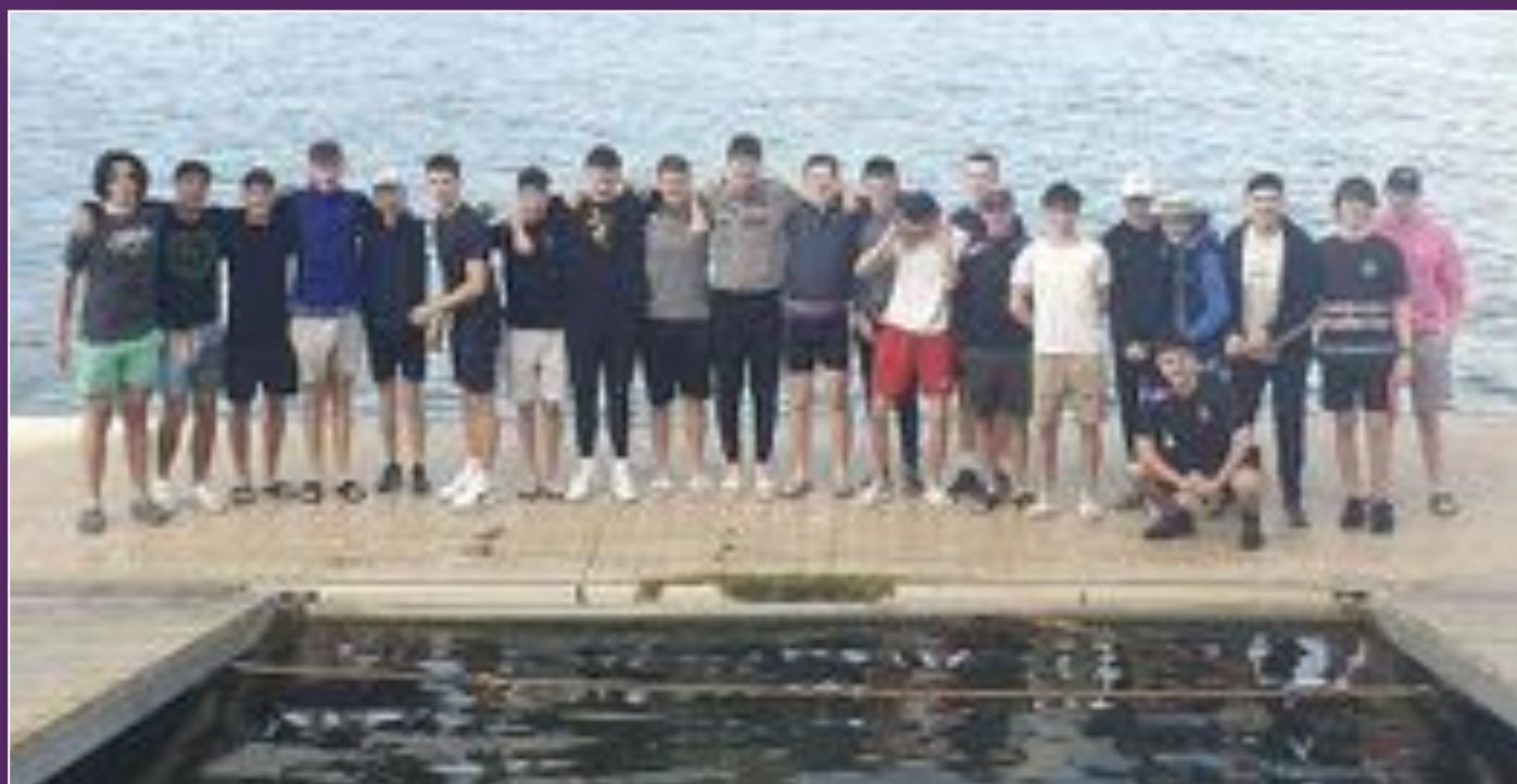
A post recovery swim is on the cards for the rowing squads after their training camp exertions

Over the Easter break, 22 rowers from the Junior 16 and 18 squads travelled to Amposta, Spain for a week-long training camp. The camp would provide the rowers with a change of scenery from the Marina, and hopefully some warm and sunny weather! Two sessions per day saw the squad clock up 200km of rowing by the end of the week in great conditions. When not on the water, the rowers enjoyed downtime in the quiet town of Amposta while recovering for the following days training. On the final day of camp, the group headed to an adventure park for a well-deserved break from the boats! A big thank you to Ms Cathy Hennessy, Ms Shannen Dawkins, Mr Eoin Hennessy and Mr Stephen Hayes who looked after the group for the week. We are also very grateful to Irish Rugby Tours for their help organising the trip.