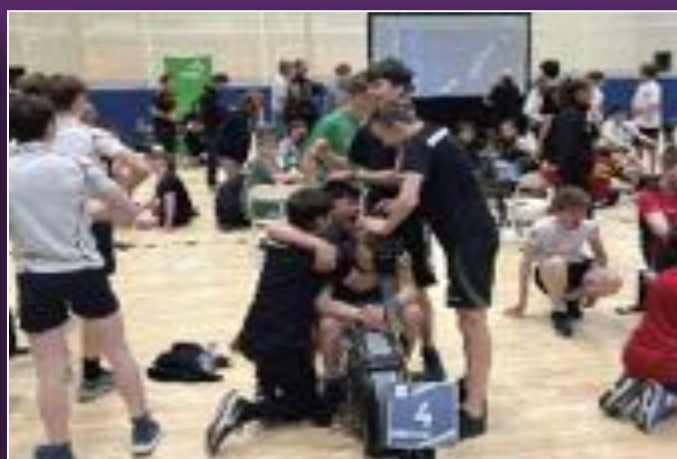
Our 1st Years win gold at the Munster Schools Indoor Rowing Blitz