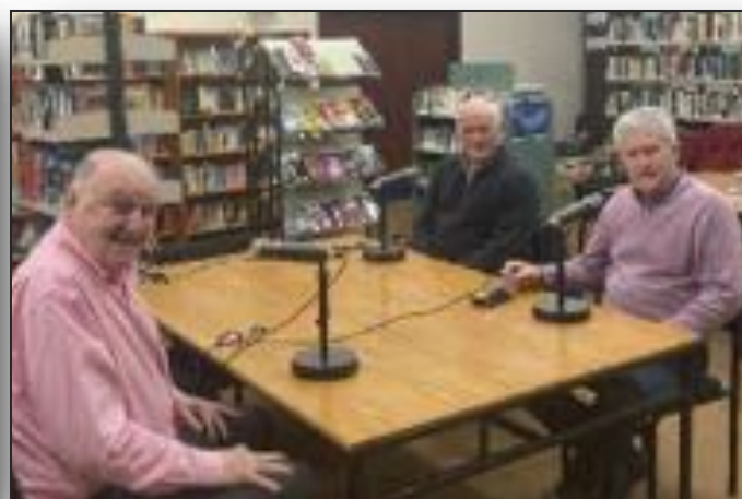
George Hook talks to Michael Kiernan and Moss Finn