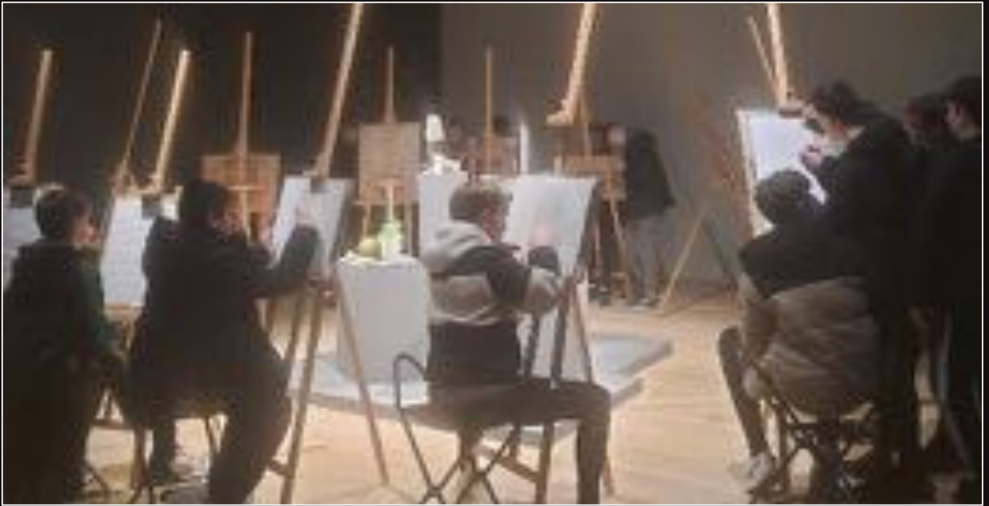
The PBC Art students hard at work