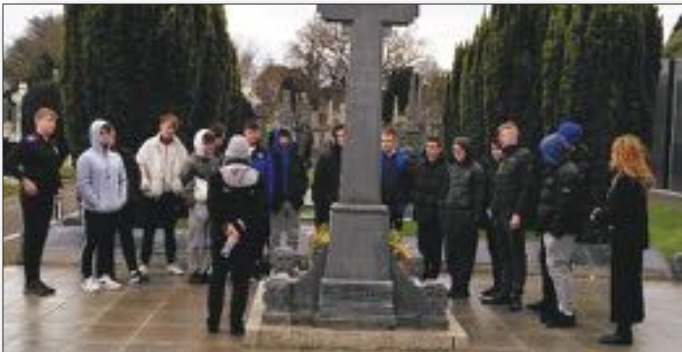
History and Politics students at the grave of Michael Collins in Glasnevin Cemetery