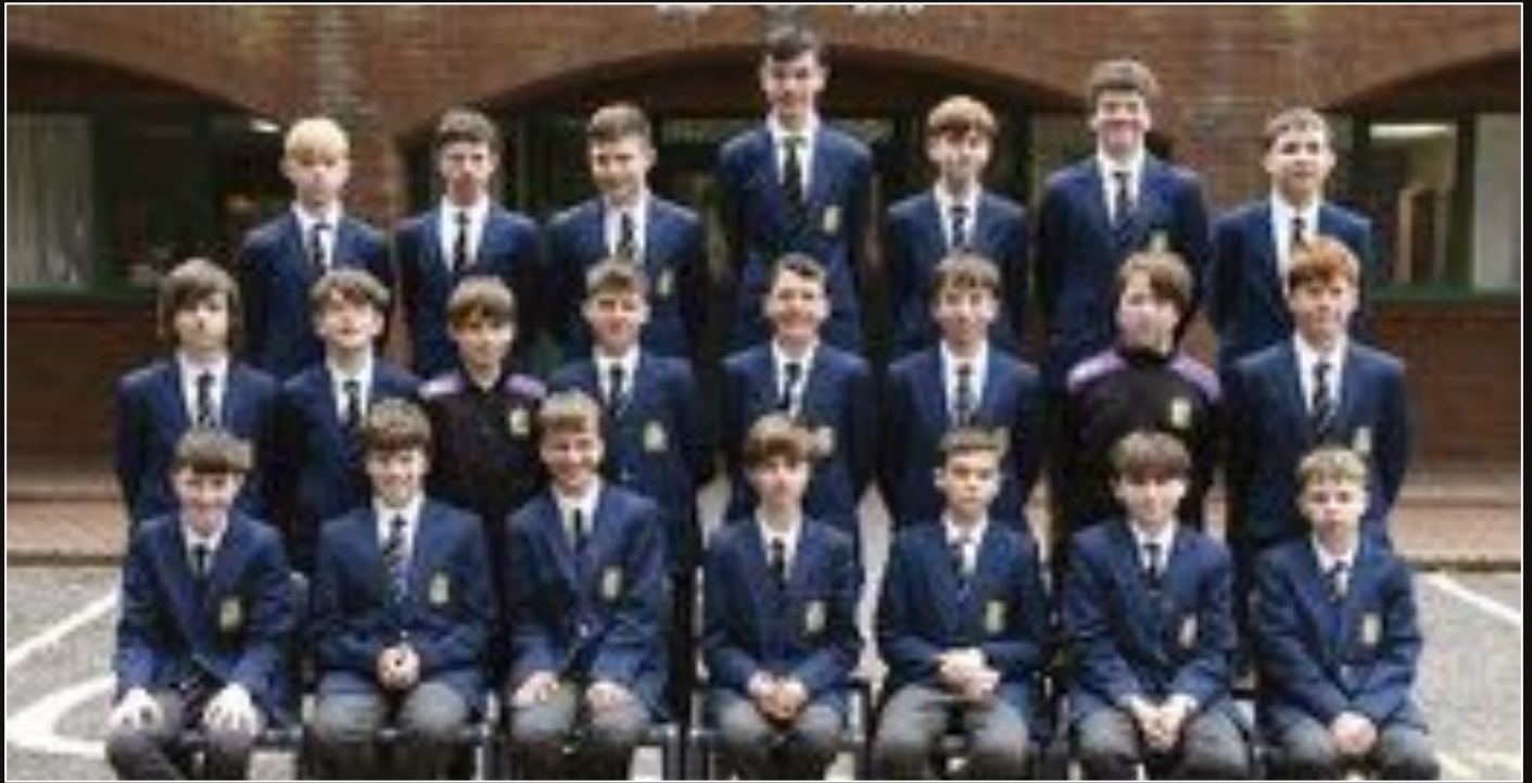
1st Year Rowers 2022 - 2023