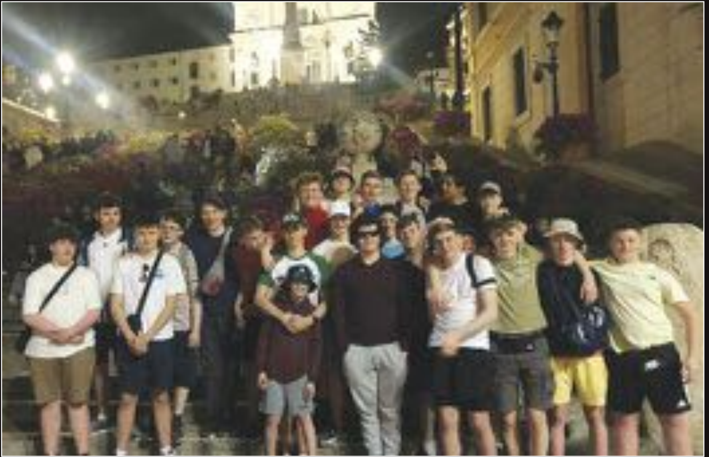
Students on the famous Spanish Steps in Rome