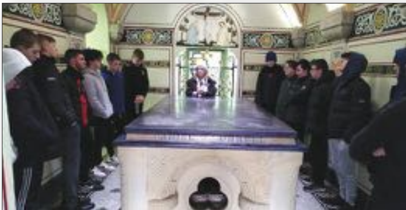
Senior Cycle students in Daniel O'Connell's tomb in Glasnevin Cemetery