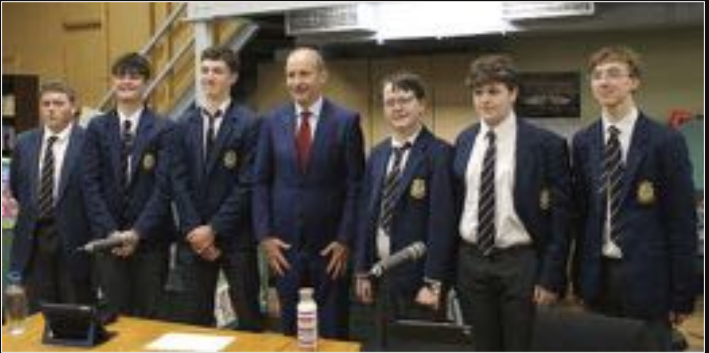
Members of the PBC Podcast welcome Tánaiste Micheál Martin TD to Pres