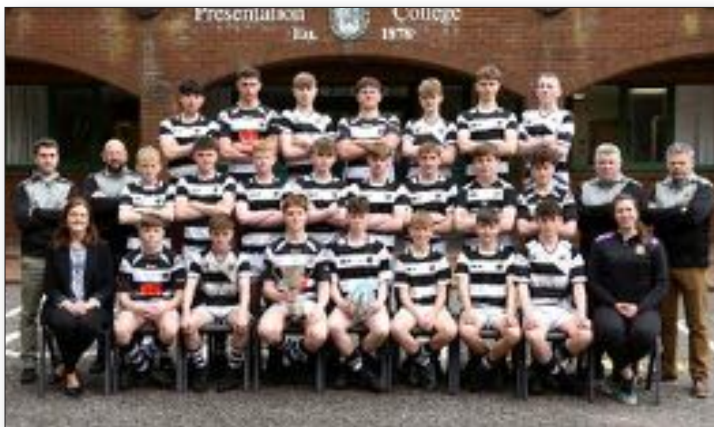
The victorious 2023 McCarthy Cup Squad