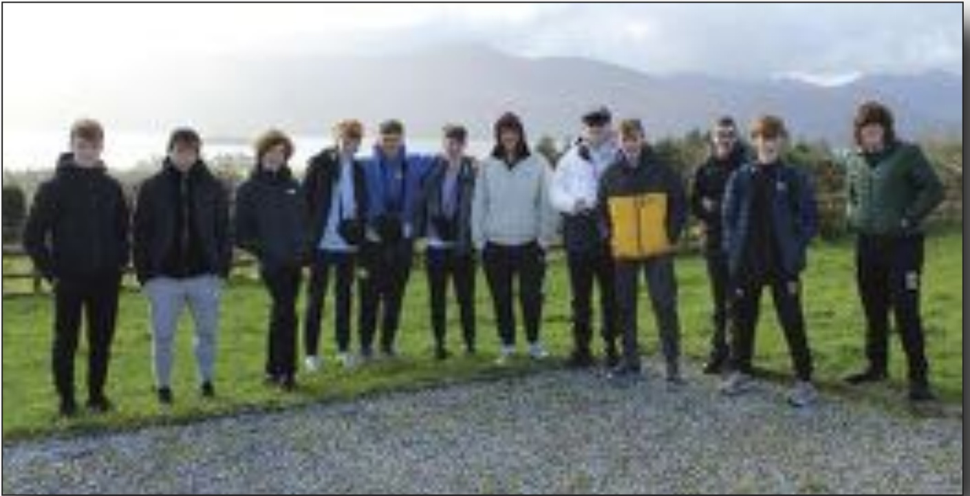
Photography students in Killarney on a field trip