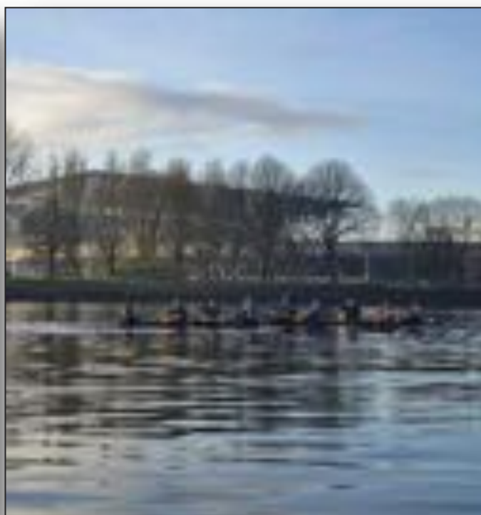
Passing Pairc Uí Chaoimh on a cold morning