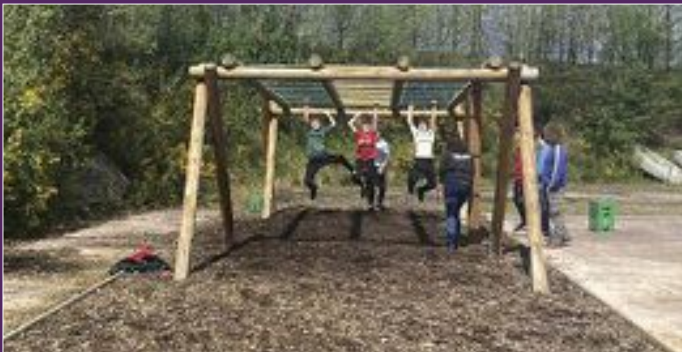
3rd Year students take on the Monkey Bars Challenge

On April 24th, 3rd Year students went on a school tour to Ballyhass Lakes, Coachford. Fortunately we were very lucky with the weather on the day and upon arrival we split into our groups. We participated in various activities, including archery, a high nets course, team challenge course and the Aquapark which proved popular amongst everyone.