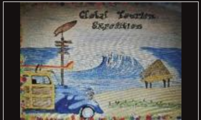
Ryan Underwood, 2012