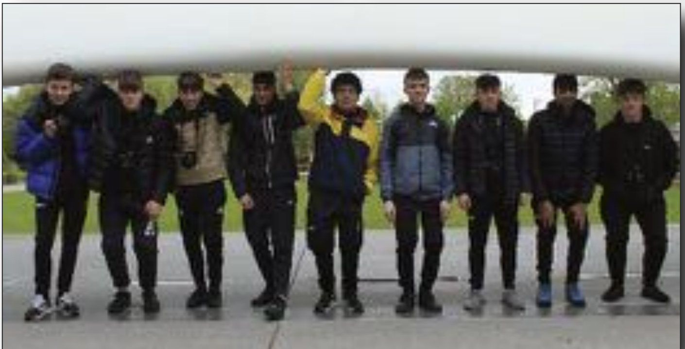
Photography students pictured at the band stand in Fitzgerald's Park