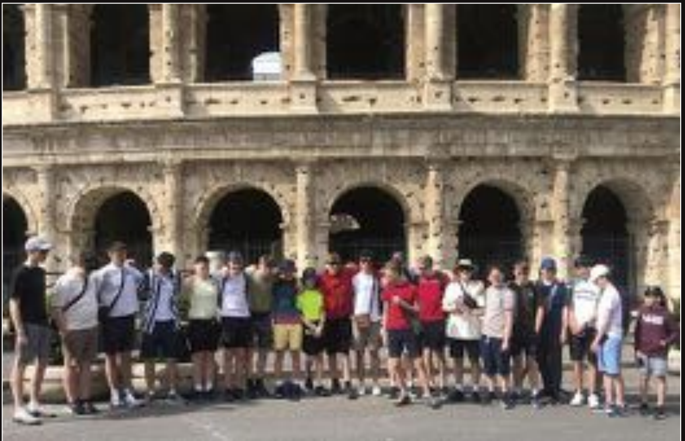
Students pose outside the Colosseum